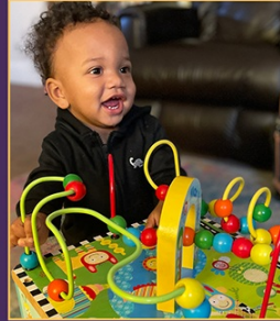
One of our littles playing at our Day Center.